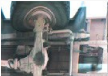
Scanned Lorry Section