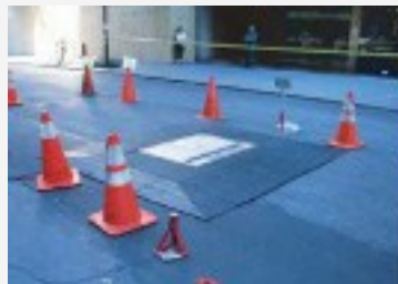
Typical Mobile Installation